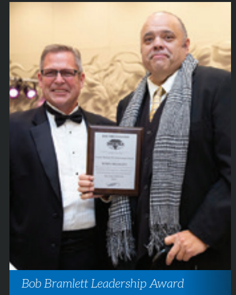
Bob Bramlett Leadership Award