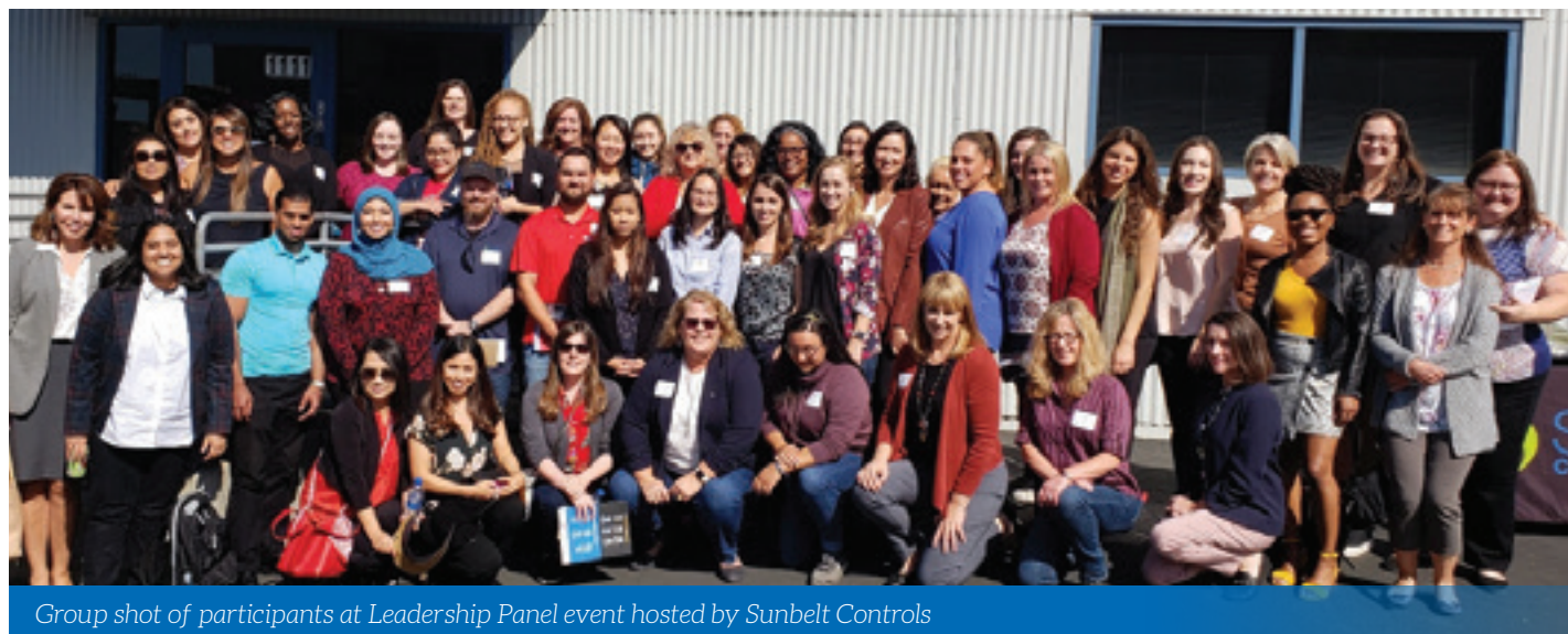
Group shot of participants at Leadership Panel event hosted by Sunbelt Controls