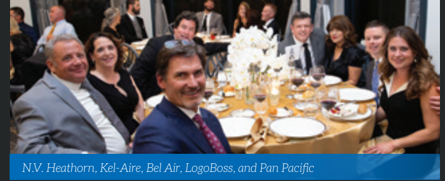
N.V. Heathorn, Kel-Aire, Bel Air, LogoBoss, and Pan Pacific