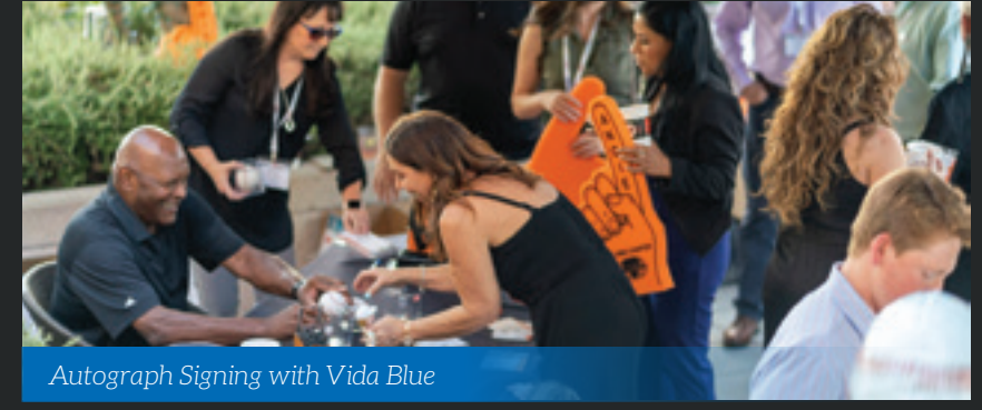
Autograph Signing with Vida Blue