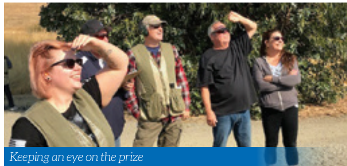
Keeping an eye on the prize