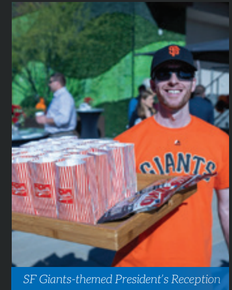
SF Giants-themed President's Reception