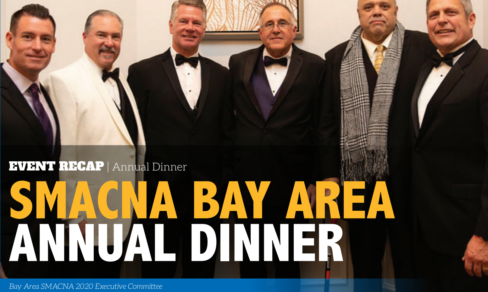
EVENT RECAP | Annual Dinner