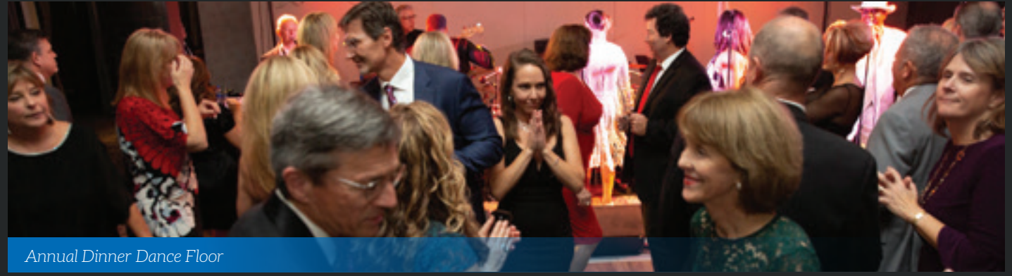
Annual Dinner Dance Floor