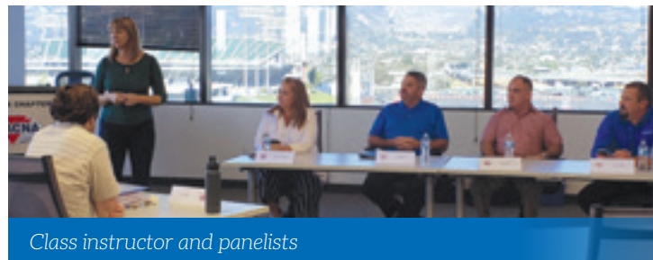
Class instructor and panelists