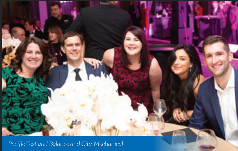
Pacific Test and Balance and City Mechanical